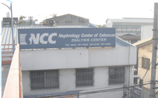
Nephrology Center of Caloocan uses Claro Vida ion exchange regeneration technology in their nine dialysis centers.