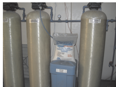
Claro Vida satisfies the water purification quality that is required for dialysis treatments among kidney cancer patients in the 9 branches Nephrology Center of Caloocan.